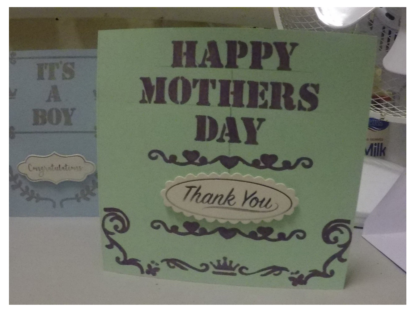
Handmade cards for family members

Finally, most interviewees commented on how participation in the arts allowed people to show a different, more personal side of themselves and to create other, more positive and creative identities than those associated with their offending behaviour, for example rapper rather than gang member.