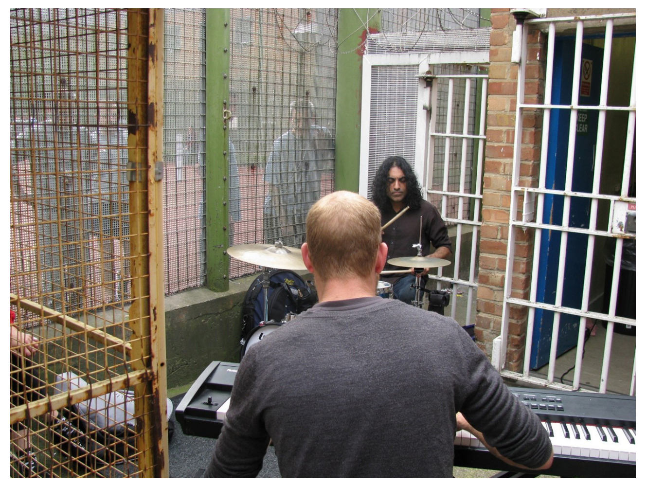
Performing in the yard

Other local prisons heard about the initiative. In addition to the Talent Unlocked festival running at HMP Stafford, Ingeus also supported HMP Stocken to start a "Studio in a Rucksack" service and has facilitated partnerships between that prison and local arts groups.