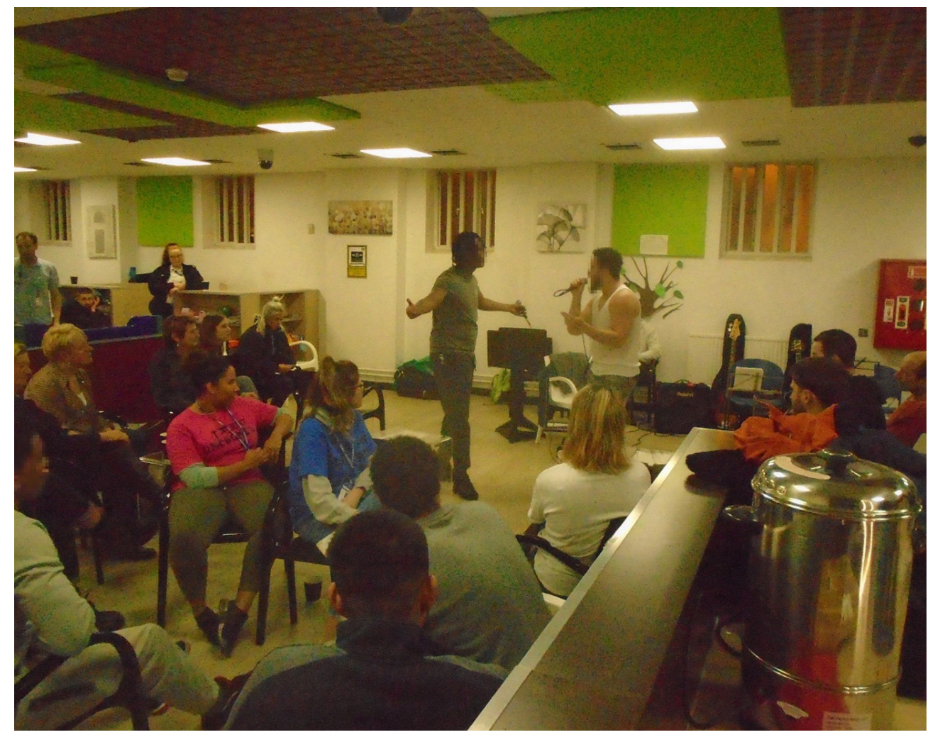
Prisoners performing at Talent Unlocked