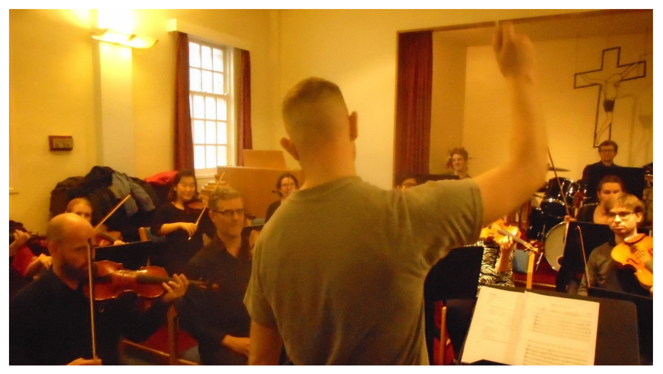
Prisoner conducting DMU orchestra