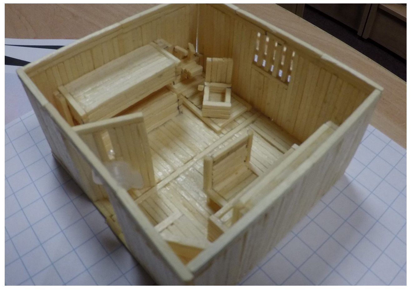
Prison cell made from matchsticks

However, activities did not stop there. With the continued support of a new governor team, Ingeus continued to deliver an ad hoc programme of arts activities, adapting to the changing Covid restrictions. Ingeus also co-ordinated the development of a wide range of in-cell arts packs alongside community partners such as Soft-Touch. The local Leicester community also got involved in supporting people in prison with individual residents partnering with local arts shops to raise funds for materials. The model in the image below was one of many produced by prisoners during the pandemic.