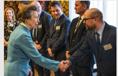
Page 3 Celebrating The Butler Trust Awards