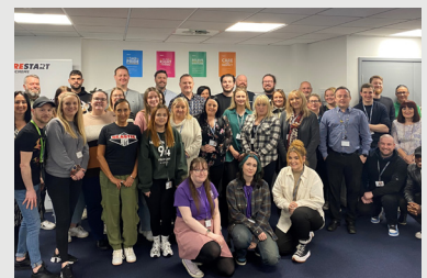
Page 8 Youth Voice Ambassadors visit the Restart Scheme