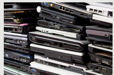
Page 7 Recycling old laptops brings new hope for jobseekers